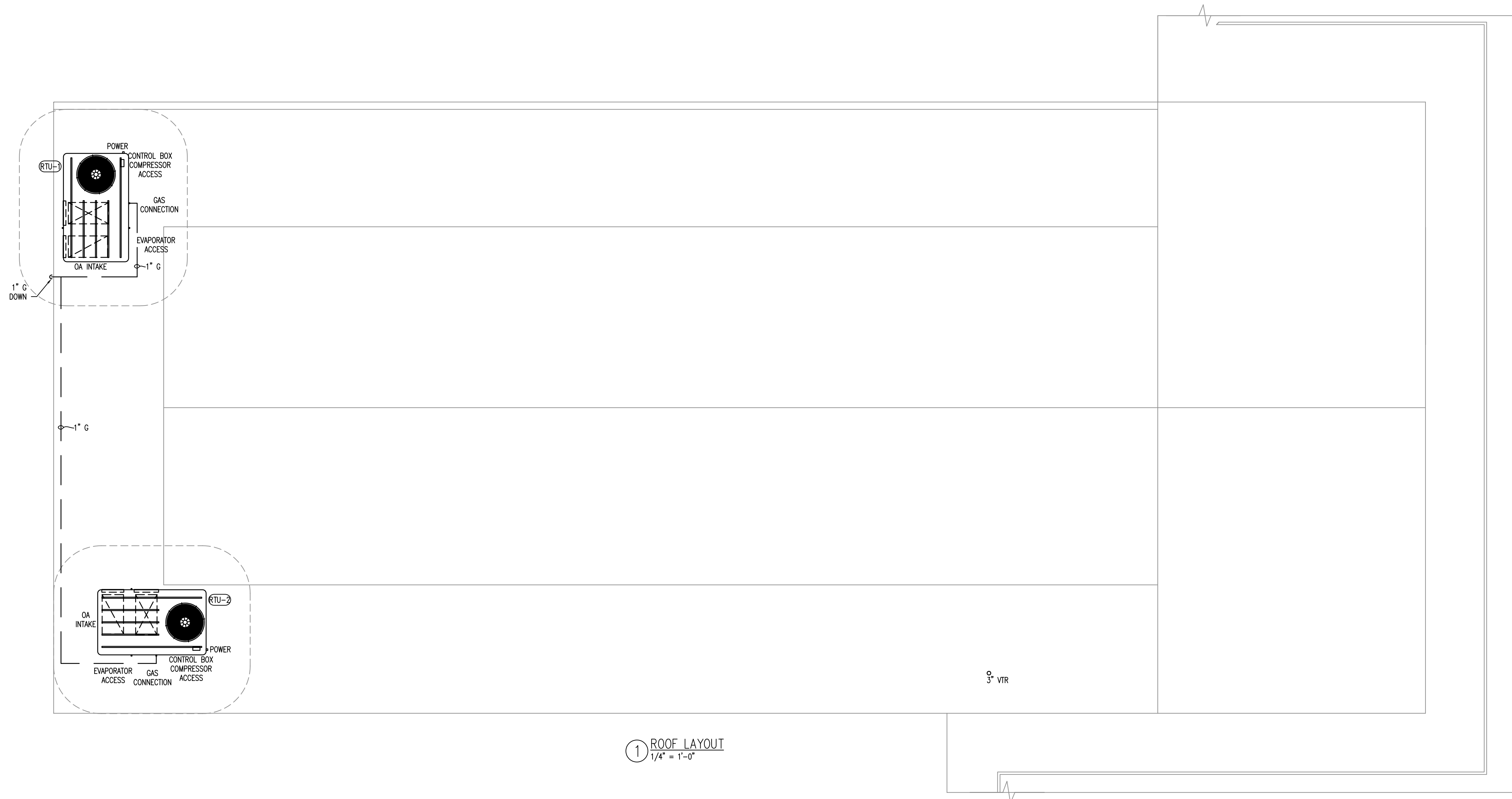
1 ROOF LAYOUT 1/4" = 1'-0"

BRUEGGER'S AT WESTVILLE WHALLEY AVE. NEW HAVEN, CONNECTICUT